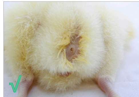
Healed navel with small string (string does not protrude above chick down)