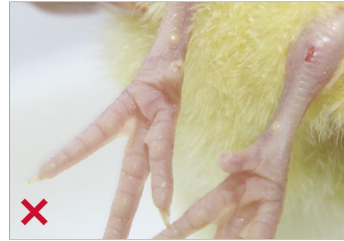
Open cut or abrasion on hocks