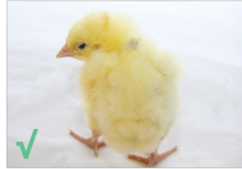
Small grey spot