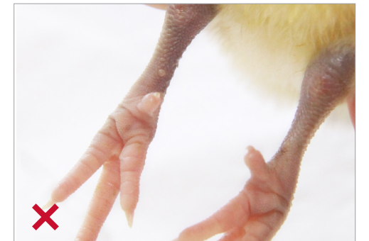
Dark grey or black hocks