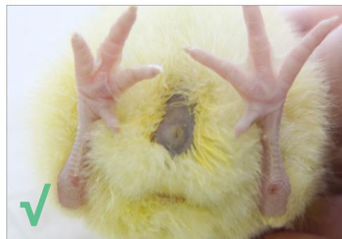
Well healed navel