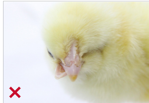
Cross beak or anatomical defects