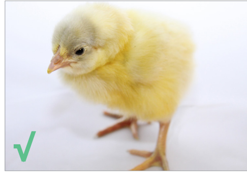
Light grey feathers and legs