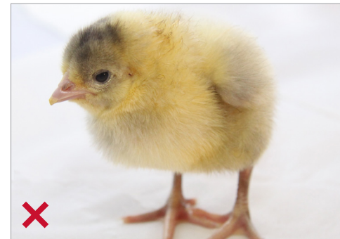
Majority dark grey or black