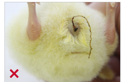
Large or long string on navel