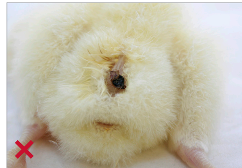
Large button on navel